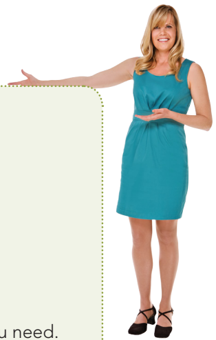
Sharyl Barney We serve members from behind the scenes.

You are entitled to as many telephonic or web-video consultations as you need. You are also entitled to 5 face-to-face clinical consultations per incident, per benefit period.